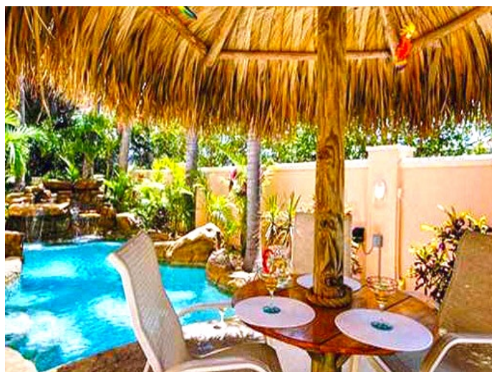
A beautiful tropical pool area