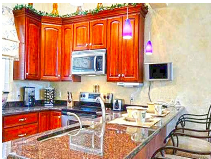
Open style kitchen with the breakfast bar