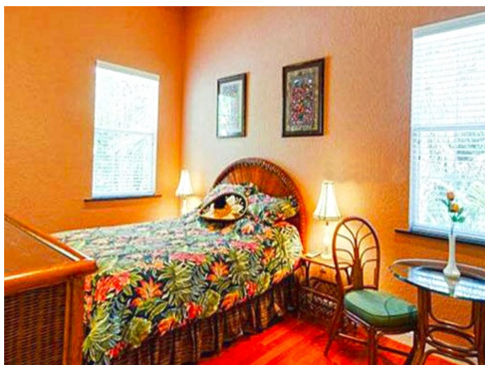
Cozy bedroom with the double bed