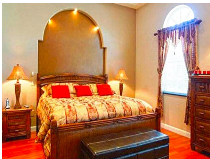
Main bedroom with the king-size bed